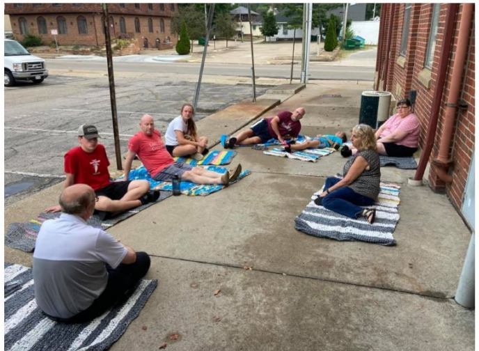
2021 has been another unique year due to the pandemic. As we wrap up the year we are asking the members and friends of Trinity to consider an additional contribution to help us balance out the year. During 2021 Trinity started back in mission with the Back Bay Mission Trip, North Street Mission and the Esperanza Mission trip.