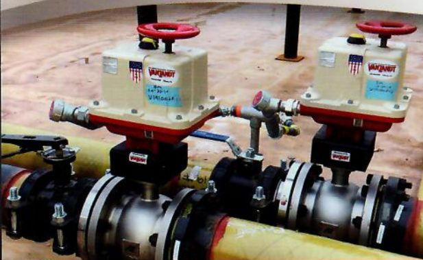
FOR PRODUCED WATER

We focus on technologies that really work, to benefit our industry, and our country!