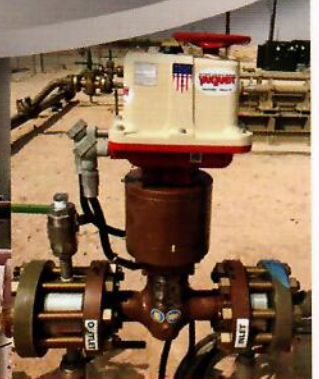
HP MasterFlo Chokes