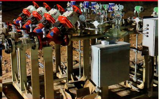
Automated Gas Lift Skids