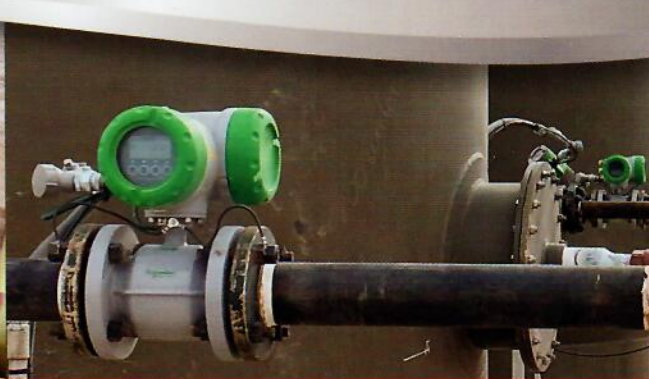
Mag & Vortex Meters