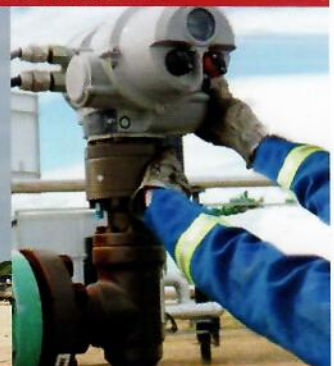
Automated Wellhead Chokes