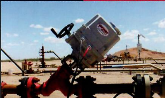
FOR GAS LIFT