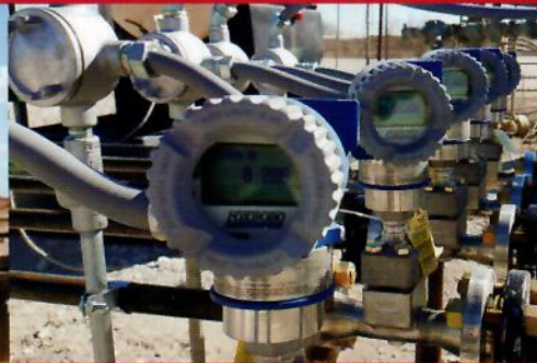
Vortex Allocation Meters