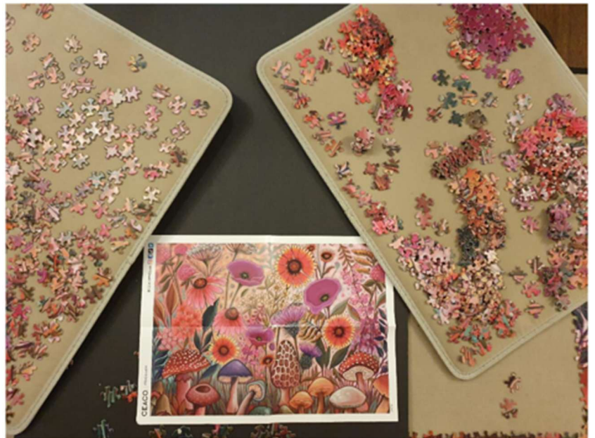
Puzzle Group's Project, March 4 th