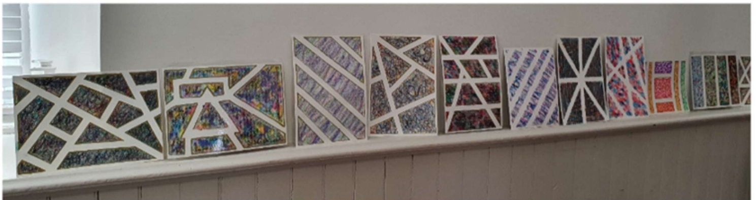
Arts & Crafts Project, "Stained Glass" Scribble Art