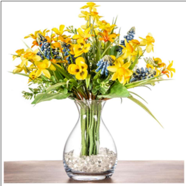
Arts & Crafts Project, February 25 th Faux flowers and water with clear beads

The Sequence, Arts and Crafts, and Puzzle groups continue to meet monthly in Greenbank. Please contact Maureen at: maureen@mr-radon.ca if you would like more information.