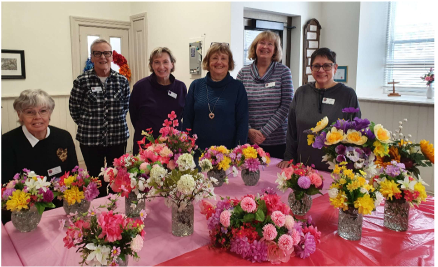
This is a photo from our February 25 th Arts & Crafts Interest Group. Glass pebbles, faux water, faux flowers, and beautiful creations.