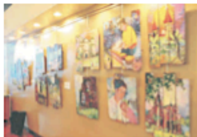
Also featured are: (clockwise) Coleca Church, Kullatang, Molo Church, Iloilo, Bellis on the Hill, Mother and Child and San Jose Church in Iloilo.