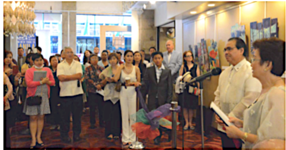
Diplomats, artists and members of the Filipino-American community in New York graced the opening of the exhibit "Seeing Beyond: An Artist Journey" at the Philippine Center, New York.