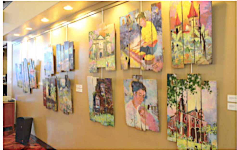
Also featured are: (clockwise) Calaca Church, Kulintang, Molo Church, Iloilo, Bells on the Hill, Mother and Child and San Jose Church in Iloilo.

"Seeing Beyond: An Artist's Journey" is the centerpiece cultural presentation of the Philippine Consulate General in New York for the 2015 celebration of Philippine Independence Day. The exhibit will run until 25 June 2015.