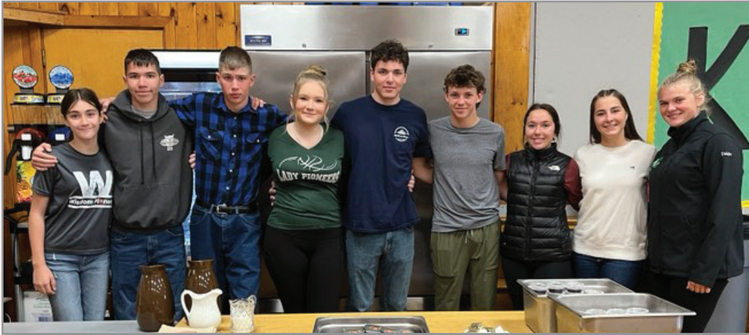
Helpers from Wisdom High School