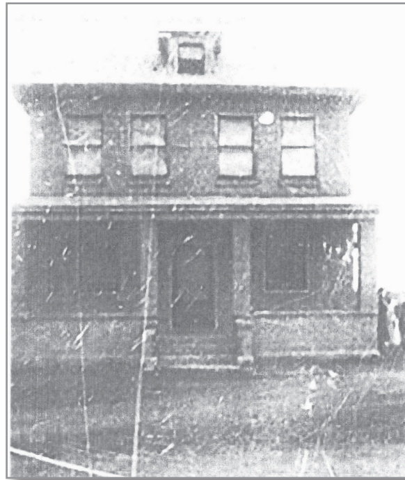
A St. Agatha Landmark - The Cement Block House