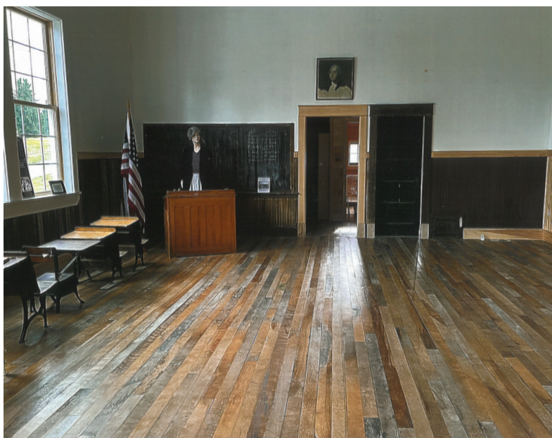
Hard wood flooring which was originally in the Queen of Peace Hall now Montfort Heights