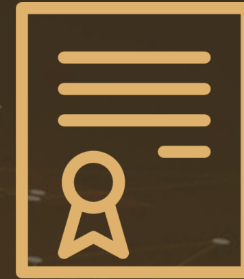
1 STAR MANAGER CERTIFICATE