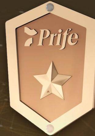
1 STAR MANAGER RECOGNITION BADGE