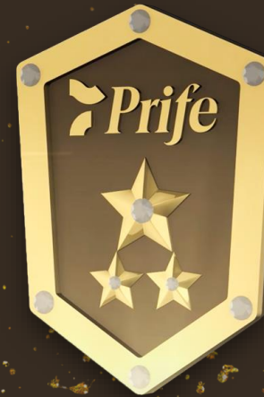
3 STAR MANAGER RECOGNITION BADGE