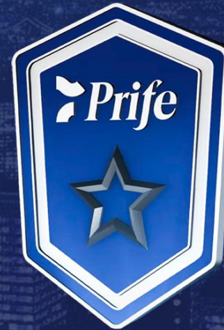
FUTURE STAR RECOGNITION BADGE