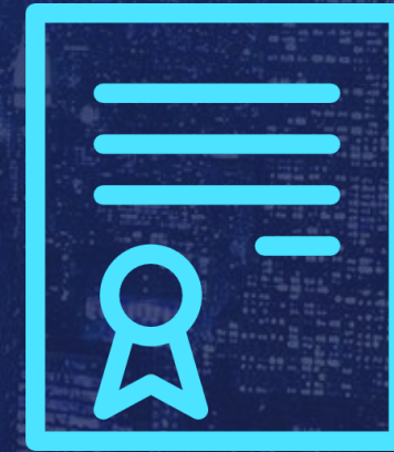
FUTURE STAR CERTIFICATE