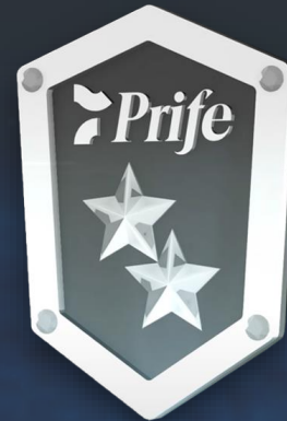
2 STAR MANAGER RECOGNITION BADGE