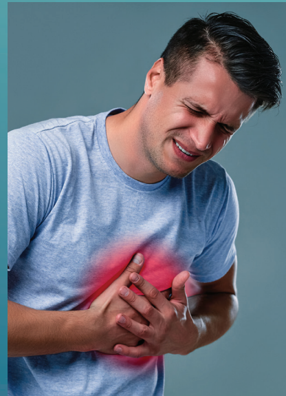
People with congenital heart and diseases