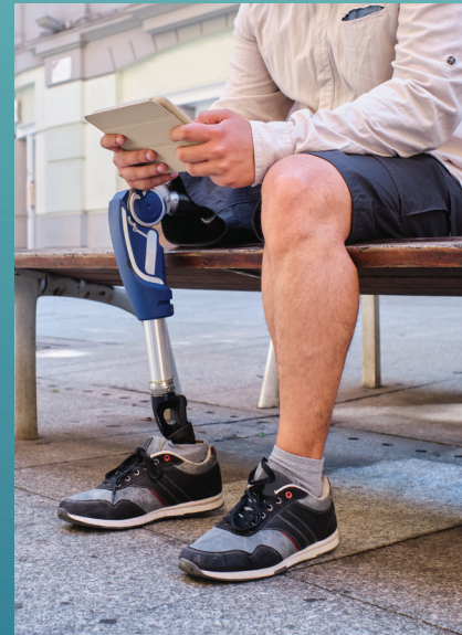
Objects Implanted/ Electronics