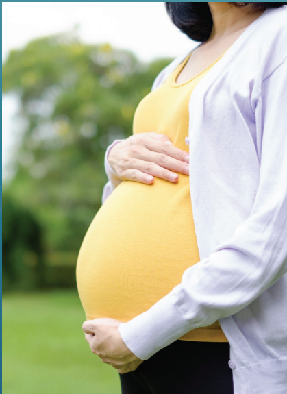
Pregnant women/ Menstruation