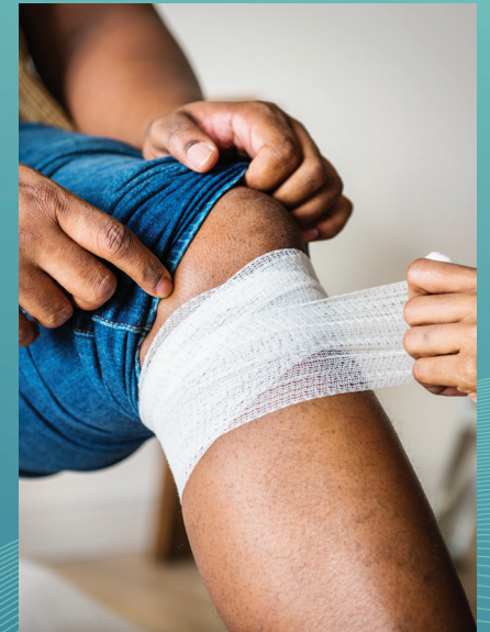
Open wound and fracture