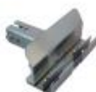
ROLL BOX HITCH