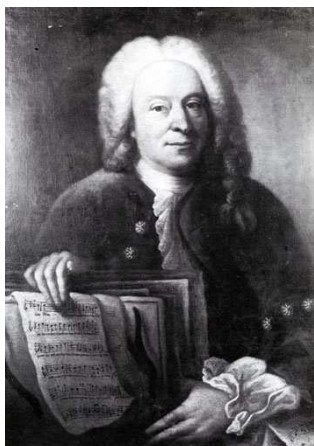
Johann Christoph Bach