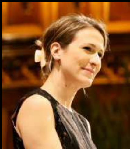
Hélène Brunet soprano