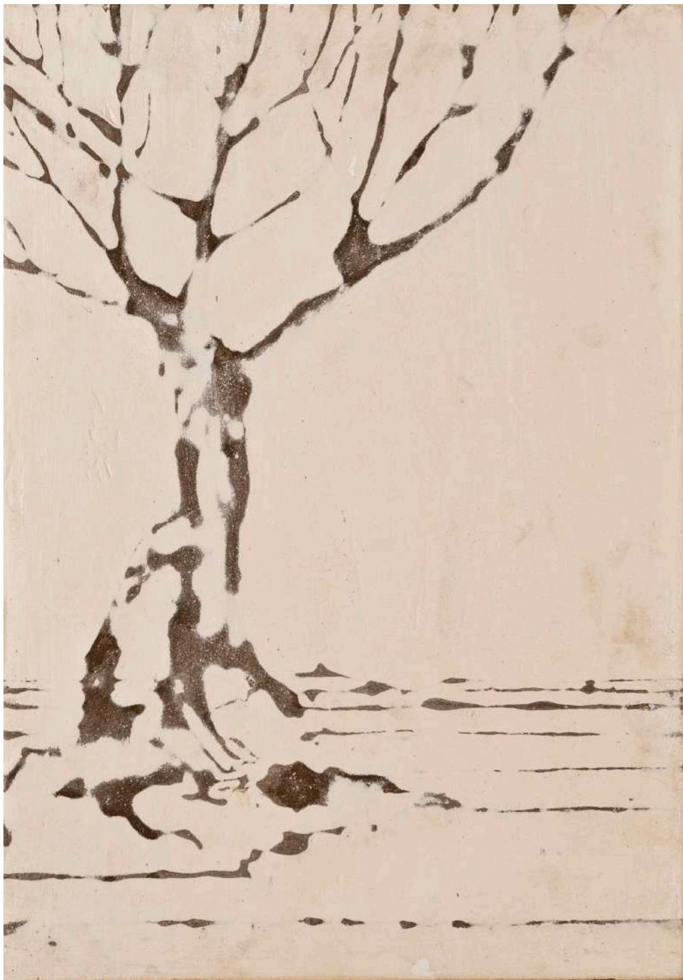
Artist: Patrizio Alviti Title: impressioni#5