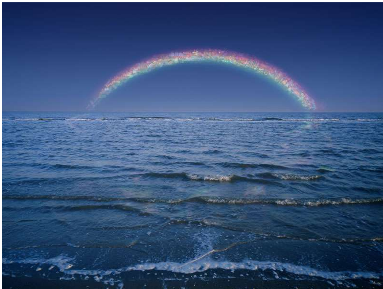
Artist: Jiang Zhi Title: Rainbow out of service Size: 120 x 160cm Medium: c print Ed: 8/10