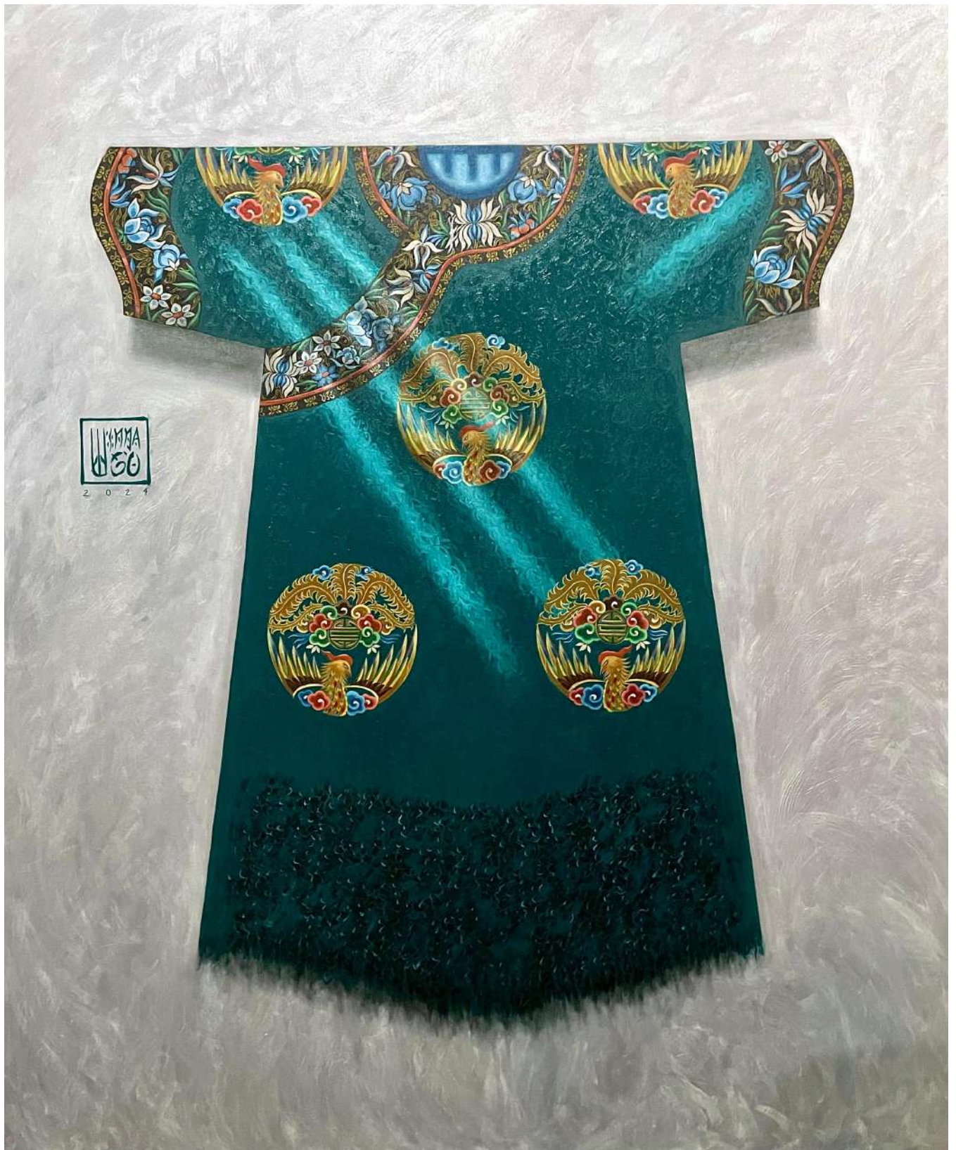
Artist: Winna Go Title: The Viridian Phoenix Size: 183 x 152 cm Medium: Oil on canvas Year: 2024