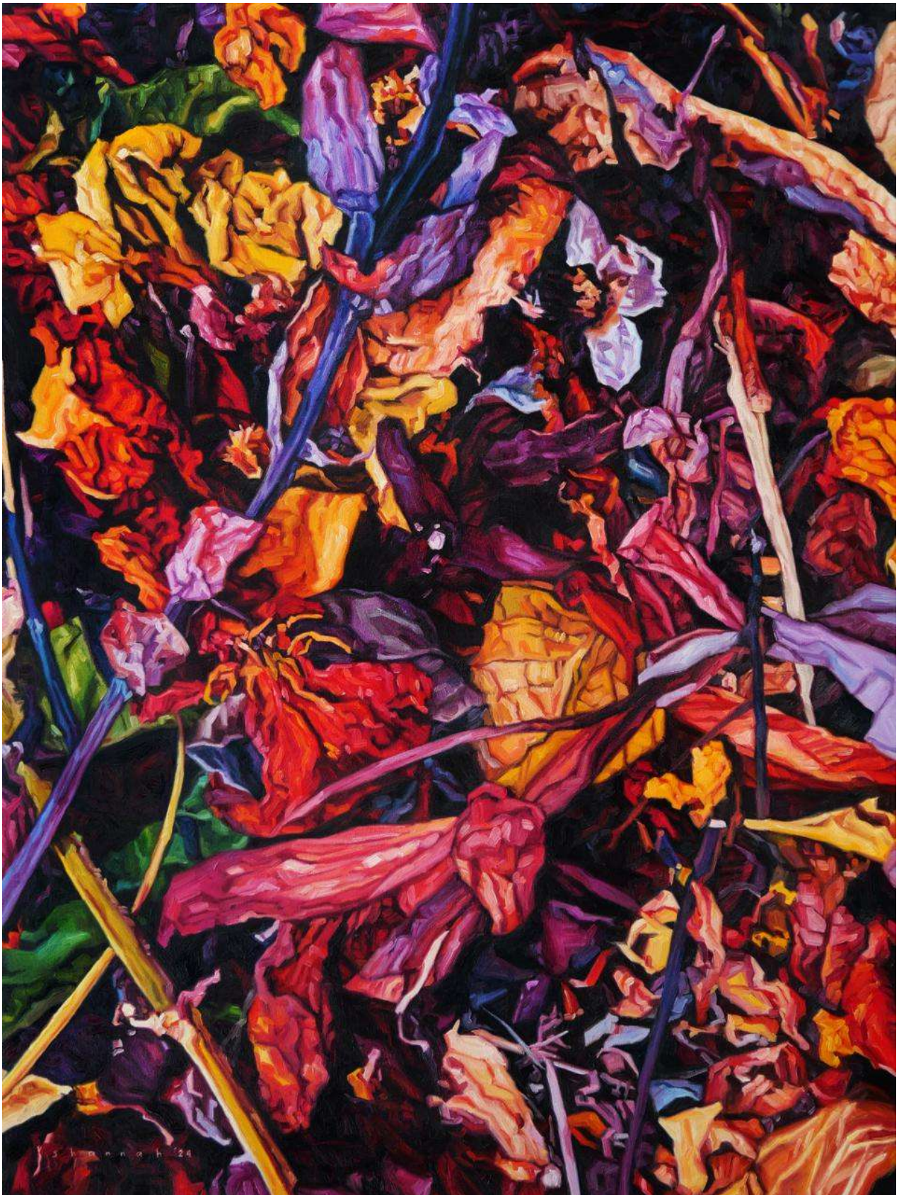
Artist: Shannah Orencio Title: Sight beyond Sight Size: 91 x 122 cm Medium: Oil on canvas Year: 2024