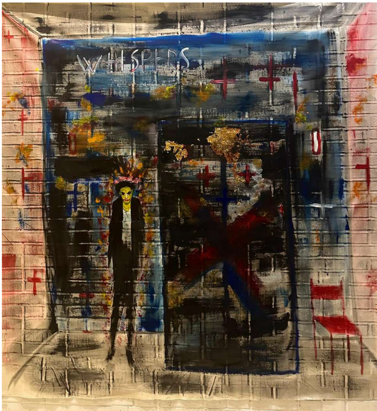
Artist: Massimo Scognamiglio Title: Whispers / Hidden Memory Medium: Mixed media on canvas Size: 200 x 200 cm Year: 2024