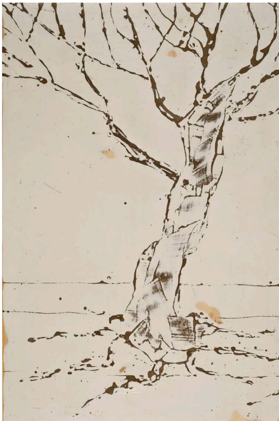
Artist: Patrizio Alviti Title: impressioni#6 Medium: wood and cement Size: 120 x 85 cm