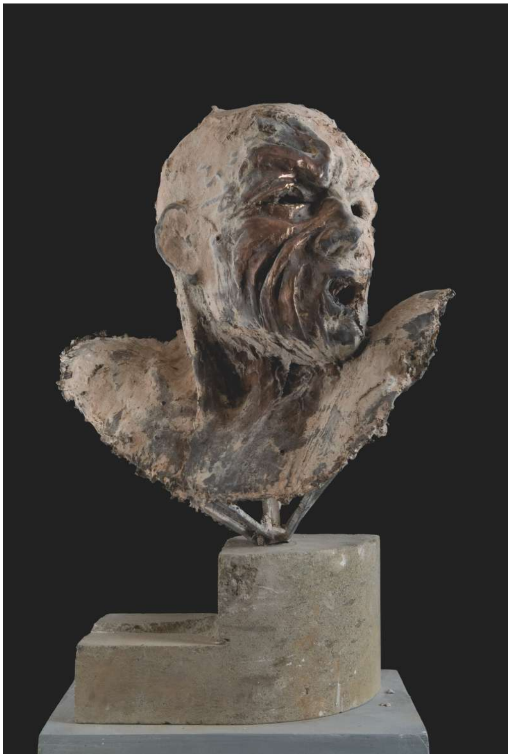
Artist: Cristiano Alviti Title: Giganti, head 1.3 Medium: Bronze Size: 62 x 40 x 30 cm Year: 2010