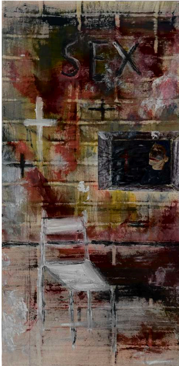
Artist: Massimo Scognamiglio Title: Sex Medium: Mixed media on canvas Size: 120 x 60 cm Year: 2024