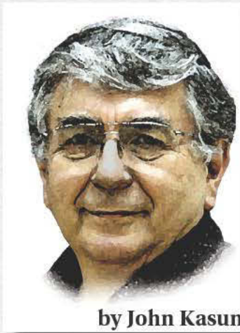
by John Kasun

At first glance, the choice might seem simple: go out and buy a new microwave just like the dead one. That seemed like a good idea until I found out that they no longer make the model with which we had lived very happily until that dark morning.