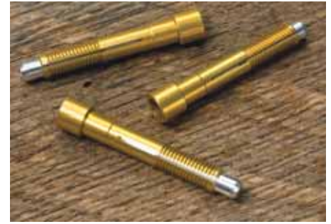
This clever new insert eliminates the need for adhesive! Easy to install or remove and excellent for in the field repairs.

For that reason the glue-in glue-on broadhead adapter is very popular. These adapters replace the screw-in inserts normally found in aluminum and carbon arrows. They are glued into the shaft, and then the broadheads (or field points, Judos, etc.) are glued onto them. This configuration is extremely strong and for that reason is gaining in popularity. That's why we introduced 100-grain solid brass glue-in glue-on adapters. Take a 125-grain point; add a 100-grain adapter and you've added 225 grains to your overall arrow mass-weight. (There's even a 100 grain brass glue-in adapter for the Axis shafts!) Some bowhunters still don't want to mess with gluing on their broadheads; they want the convenience of screw-in heads. For them we suggest the 75-grain, 100-grain or