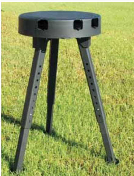
Light, portable, and strong with the benefit of a rotating seat, the "Buck" and "Bull" all-terrain seats may be the perfect seats for use in ground blinds.

Last year we mentioned that many traditional bowhunters were getting out of the trees and hunting from the ground. That is still true and sales of ground blinds like the Double Bull and Ameristep lines are still strong. This year we feel the need to mention a slick new seat designed for "on the move" bowhunters, but it fits the bill for fishing, gun hunting, sporting events, and hunting from ground blinds perfectly. They're called All-Terrain-Seats and come in two models at this time. The "Bull" and the "Buck": They are incredibly strong