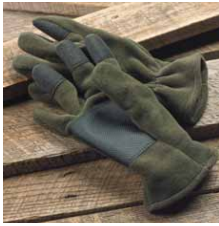
Many bowhunters hunt often in colder temperatures. The Skookum with WindStopper keeps your hands warm, helps you keep a good grip on your bow, and offers the Mega-Tuff finger stalls for a perfectly smooth release.

Last year we mentioned that many traditional bowhunters were getting out of the trees and hunting from the ground. That is still true and sales of ground blinds like the Double Bull and Ameristep lines are still strong. This year we feel the need to mention a slick new seat designed for "on the move" bowhunters, but it fits the bill for fishing, gun hunting, sporting events, and hunting from ground blinds perfectly. They're called All-Terrain-Seats and come in two models at this time. The "Bull" and the "Buck": They are incredibly strong