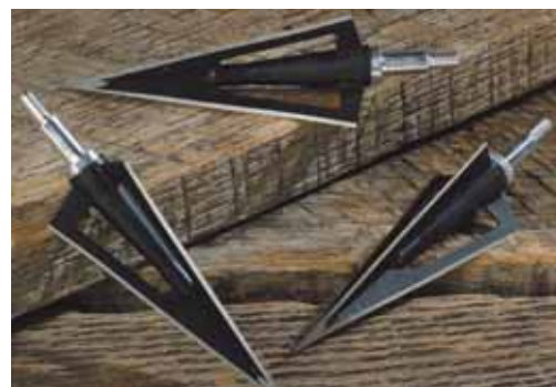
Remember heavy broadheads for the traditional bowhunters. They're shooting 125 grains and up. Heads like this, cut-on-contact, 150-grain Woodsman are exactly what they're looking for.

In addition to the weight factor, an interesting phenomenon in traditional archery is the attention paid to the strength of the broadhead to arrow attachment system. These guys won't tolerate equipment failure and tests have proven that aluminum screw-in adapters are normally the weakest link and account for most of the reported 'broadhead failures on big game.