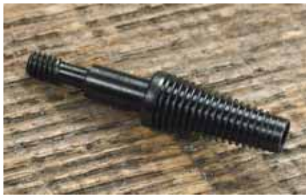
These rugged steel inserts replace the common aluminum broadhead inserts and offer the advantage of more mass weight and strength.