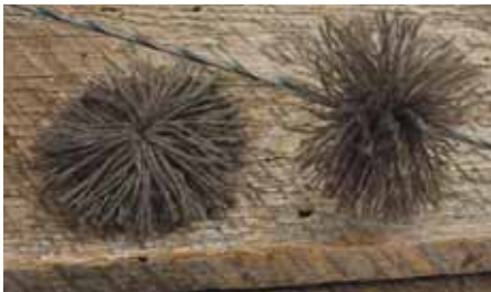
These exotic Musk Ox wool silencers are a perfect combination of lightweight materials, water resistance, and string silencing capabilities.

Once in a while a product combines old and new for an awesome application. That's the case with the new "Qiviut" musk ox string silencers. (Pronounced "key-vee-ute") "Qiviut" is the luxurious under wool from the arctic musk ox. (A true prehistoric mammal.) It's extremely lightweight and less weight on your string means minimal affect on arrow speed. At the same time it's naturally water repellent and it quiets bowstrings right now! The neutral brown hue complements any bow and they're very easy to install. These silencers are going to be big. Stock up now!