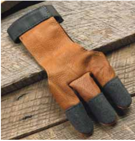
Mega-Tuff fingertips are the key to this Skookum Regular glove's overwhelming success. They offer a smooth, slick release shot after shot.

nylon finger stalls resulting in a shooting glove that offers a super smooth release in any weather. It's impervious to weather and is especially well suited to bowfishing. As a matter of fact, the glove was developed out of frustration from destroying all-leather gloves while bowfishing. These gloves are breaking new ground. They're innovative, universal, and they fill a real need quite nicely.