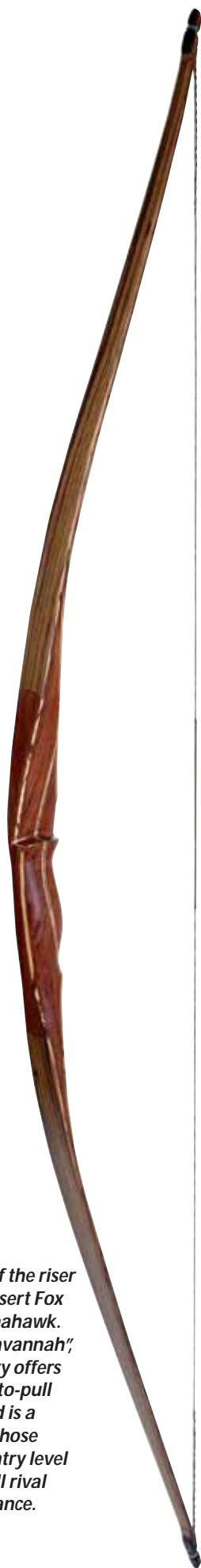
At right, The "Savannah", by Martin Archery offers excellent power-to-pull performance and is a good choice for those looking for an entry level longbow that will rival custom performance.

high-performance bow will get the job done time after time. That's very important to these serious bowhunters.