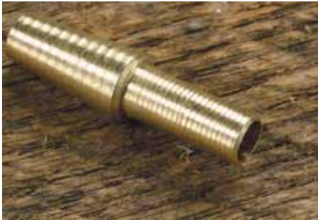
These glue-in, glue-on inserts add an extra 100 grains to your arrow set-up and increase the strength of the broadhead to arrow transition.