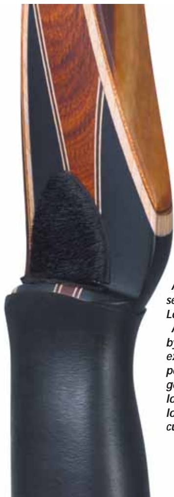
At left, details of the riser section of the Desert Fox Longbow by Tomahawk.

If they're looking for a recurve bow, the beautiful "Cheyenne" from Bear Archery is a perfect candidate for you to stock. Designed specifically for bowhunting, this