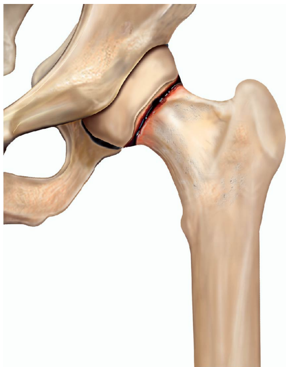
A subcapital hip fracture

A hip fracture is a break of the top of the femur, just below your hip joint. It is also known as a fractured neck of femur.