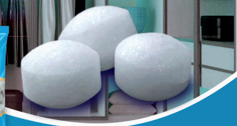
• NAPHTHALENE BALLS

Pack of : 50gm, 100gm, 200gm, 500gm, 1kg.