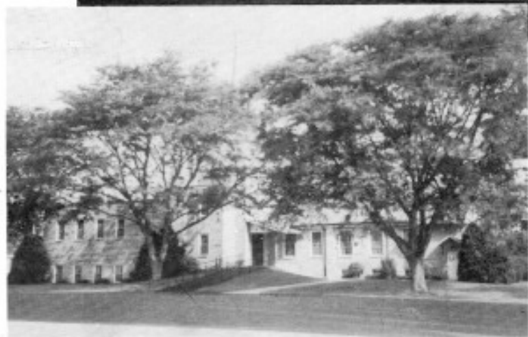
Au Sable Grove Presbyterian Church