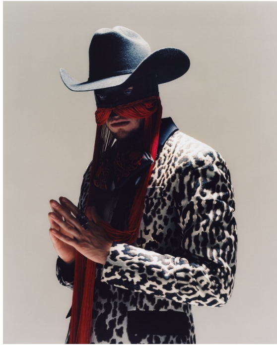
Orville Peck is the Queer Cowboy we didn't know we needed.