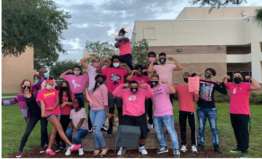
YMWOE showing support in the Fight Against Breast Cancer.