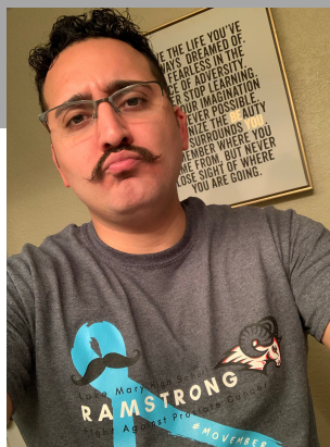
Start of November