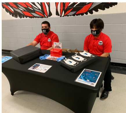
Lunch Fundraising Stand