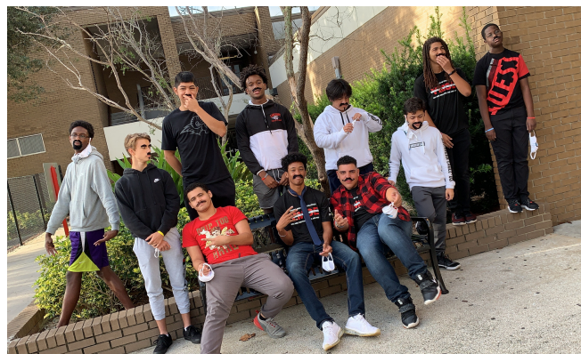
YMOE No Shave Mustache Squad