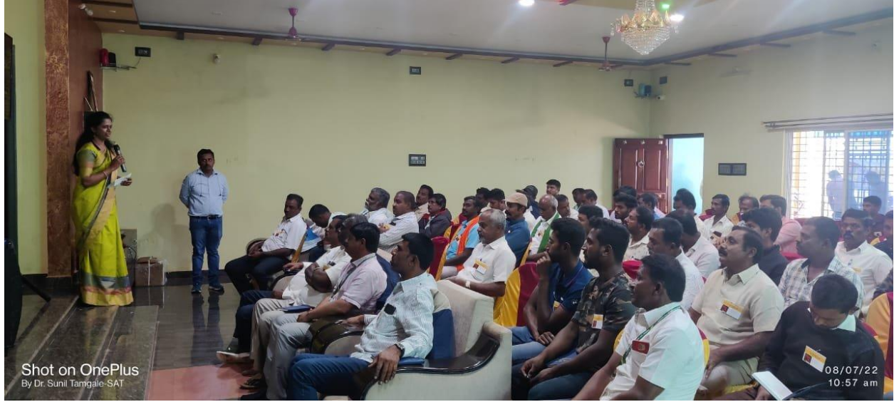
Farmer's training program on plant protection practices in Pomegranate on July 8th 2022 at Vijayapura, Devanahalli organised by Rashvee International Phytosanitary Research and Services, (IPRS) & Insect Environment, Bengaluru.