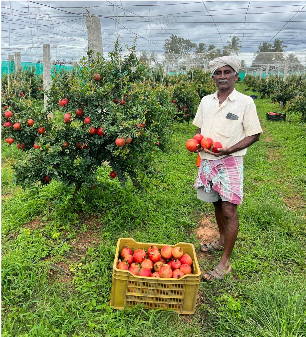
Farmers getting a profit of 5 lakh per acre with Rashvee International Phytosanitary Research and Services, consultancy