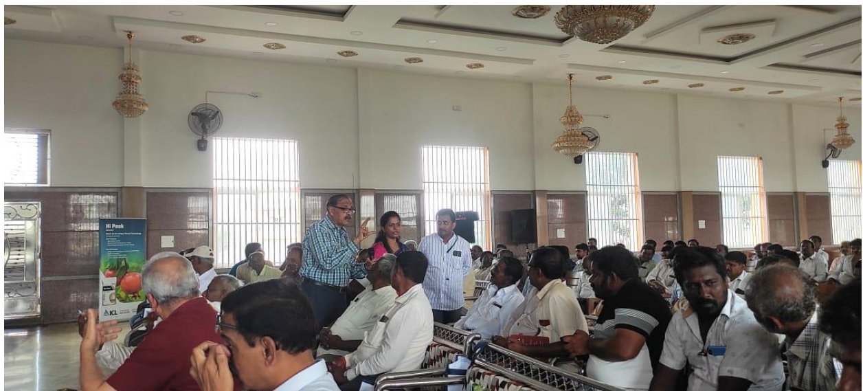
Farmer's training program on plant protection practices in Grapes on September 17th 2022 at Vijayapura, Devanahalli organised by Rashvee International Phytosanitary Research and Services, (IPRS) & Insect Environment, Bengaluru.