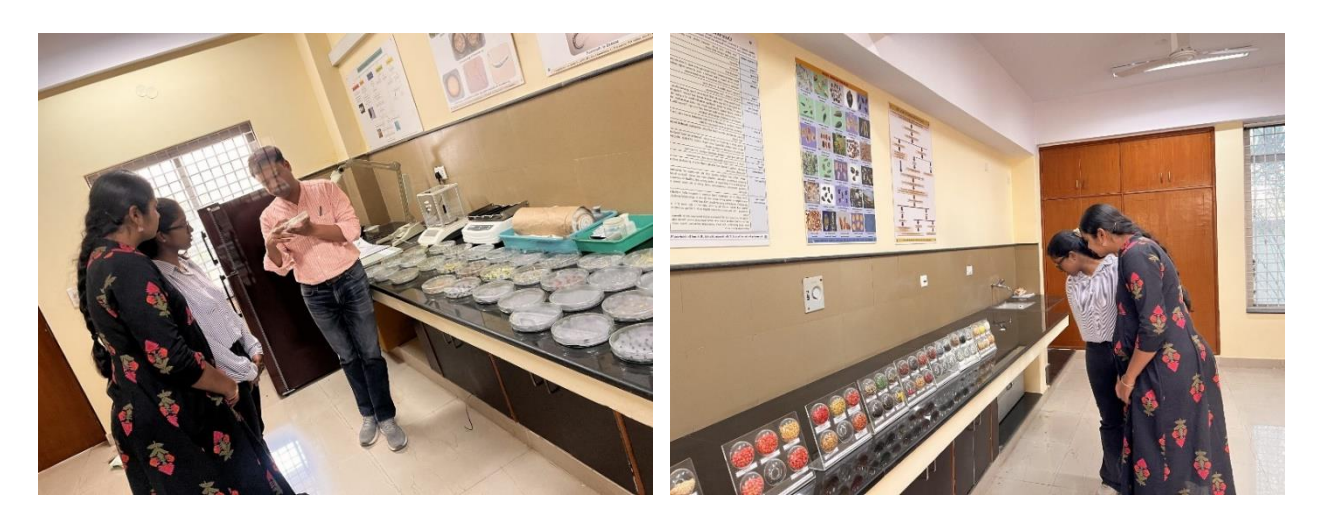
Visit of interns to Regional Plant Quarantine Station, Bengaluru