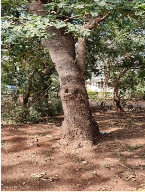
Figure 2: A) Frontal view of Albizia lebbbeck (L.) Benth

Since a fly with such a description was not reported earlier from the study location and data are scarcely available, it was important to record and publish as an observatory document. It also adds to the knowledge of spatio-temporal distribution and ecology of the species.