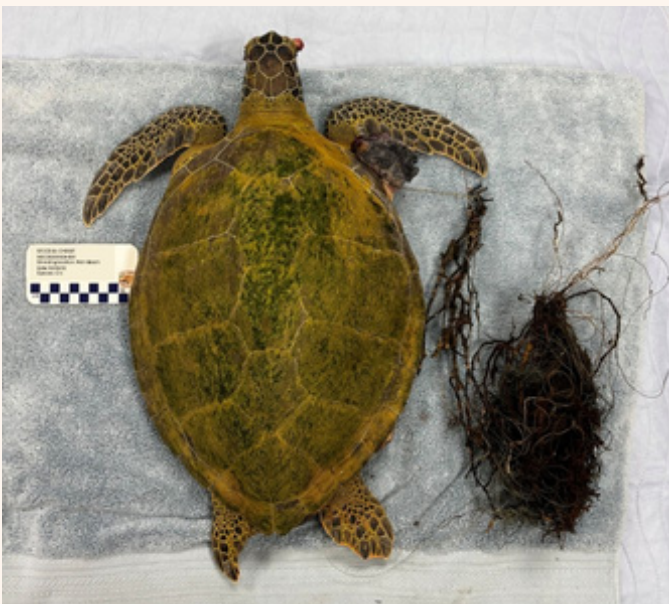
📷: Skittles arrival to our hospital