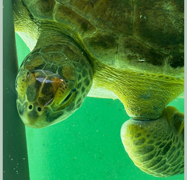
📷: Schnitzel recovering in hospital tank