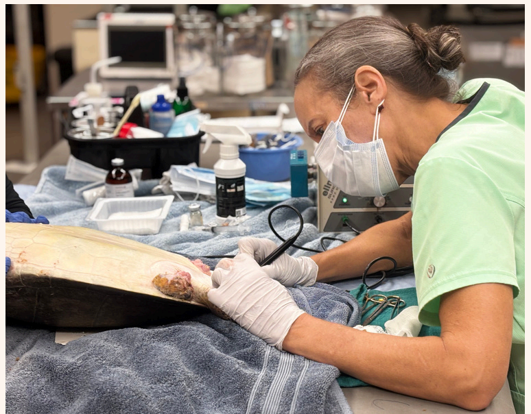
📷: Skittles tumor removal procedure