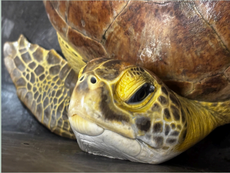
📷: Schnitzel during treatment