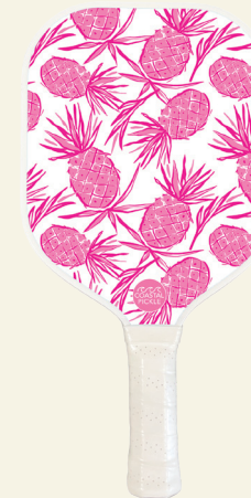
LB03 The Pineapple Punch