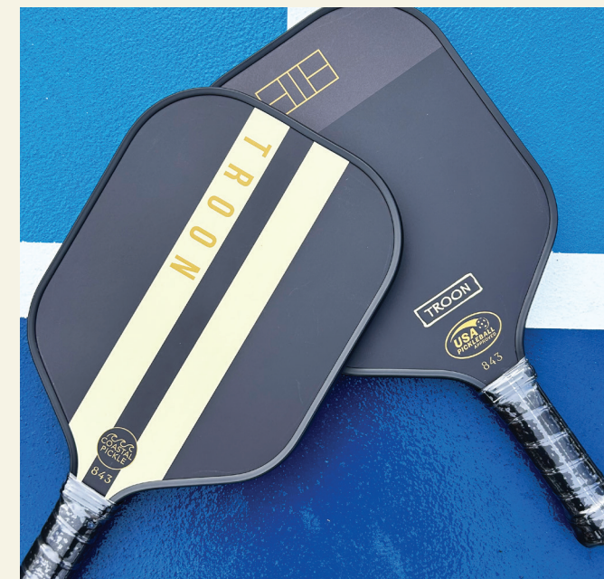
FROM LEFT TO RIGHT: Hermitage Country Club, Tradition Gold Club, Sea Pines Racquet Club, Kiawah Island Golf Resort, La Jolla Beach & Tennis Club, Special Tee Golf & Tennis, Troon