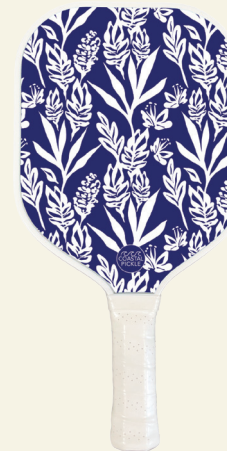
LB02 The Island Garden