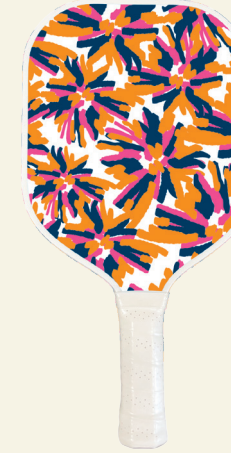
DL09 The Firework