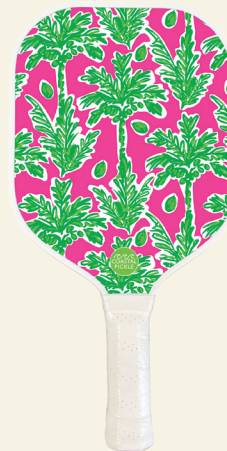
LB01 The Coconut Palm