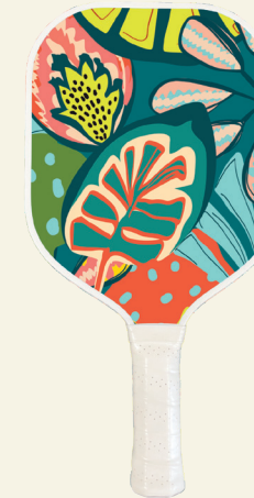
DL10 The Kalapana