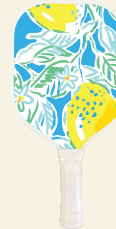
DL12 The Lemonade