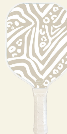
LB08 The Neutral Zebra Cat