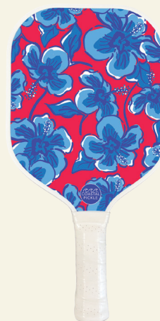
LB05 The Hibiscus