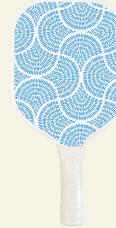
DL01 The Paloma