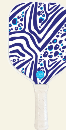
LB04 The Zebra Cat