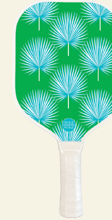
CP03 My Best Frond