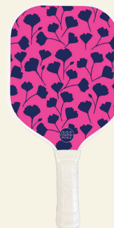
LB07 The Navy Ginkgo