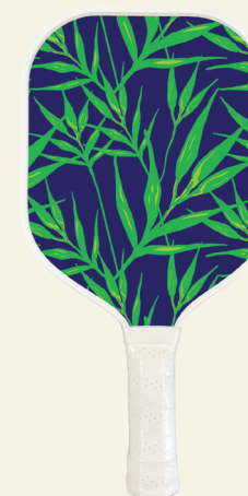
LB09 The Vine