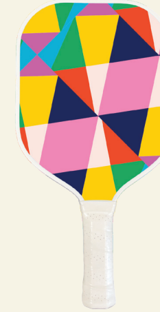
DL05 The Zippy