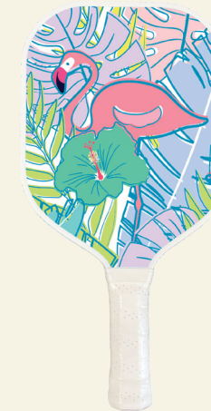
DL11 The Fifi