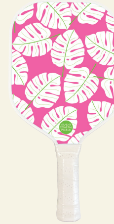
CP01 The Preppy Palm