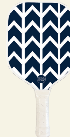
CP04 The Palmer