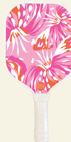
LB06 The Tropics