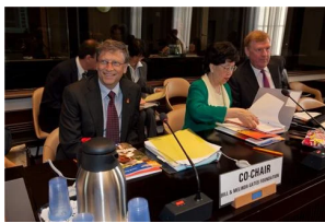
Bill & Melinda Gates Foundation Co-chair Bill Gates, WHO Director-General Margaret Chan and Independent Monitoring Board chairperson Sir Liam Donaldson.