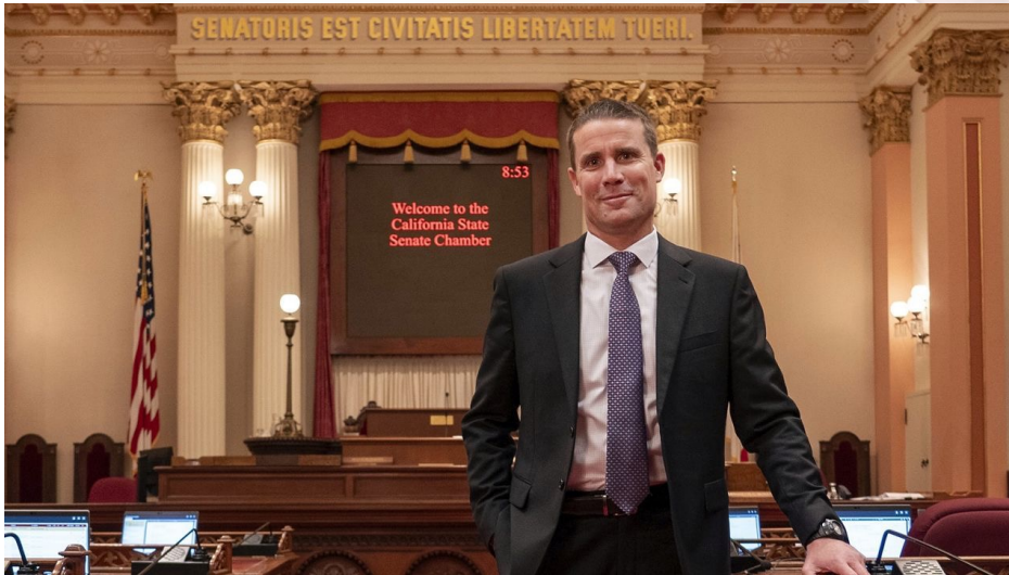
Senate President pro Tempore Mike McGuire (D-North Coast)