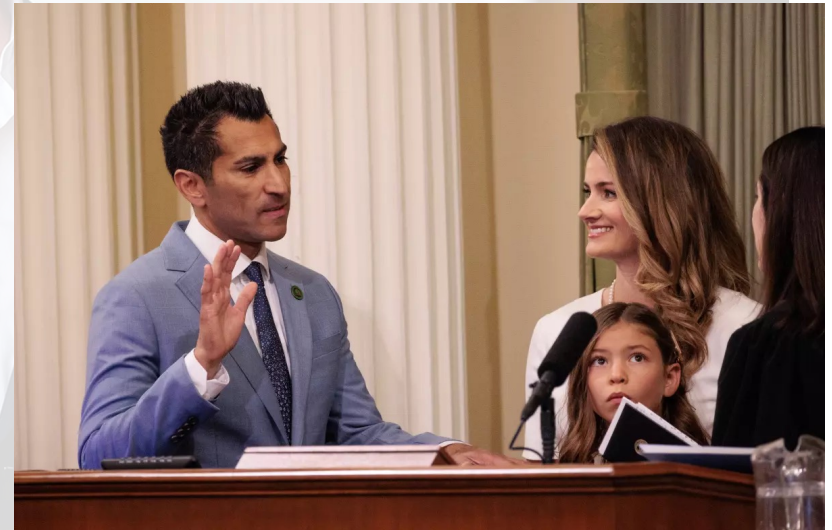
Assembly Speaker Robert Rivas (D-Salinas)