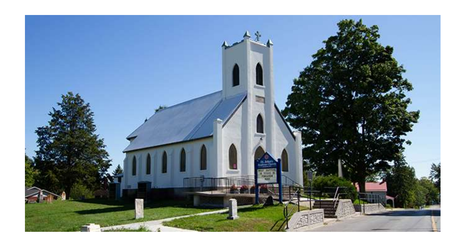
Annual Vestry Meeting (2022) 5<sup>th</sup> March 2023

212 Church Street, Bath, Ontario, KOH 1G0