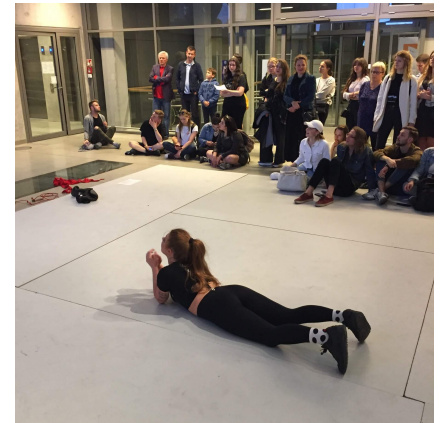
Noc Museów , Uniwersytet Artystyczny w Poznaniu (The Atrium), May 2018 featured the fourth iteration of 'Miscellaneous'.