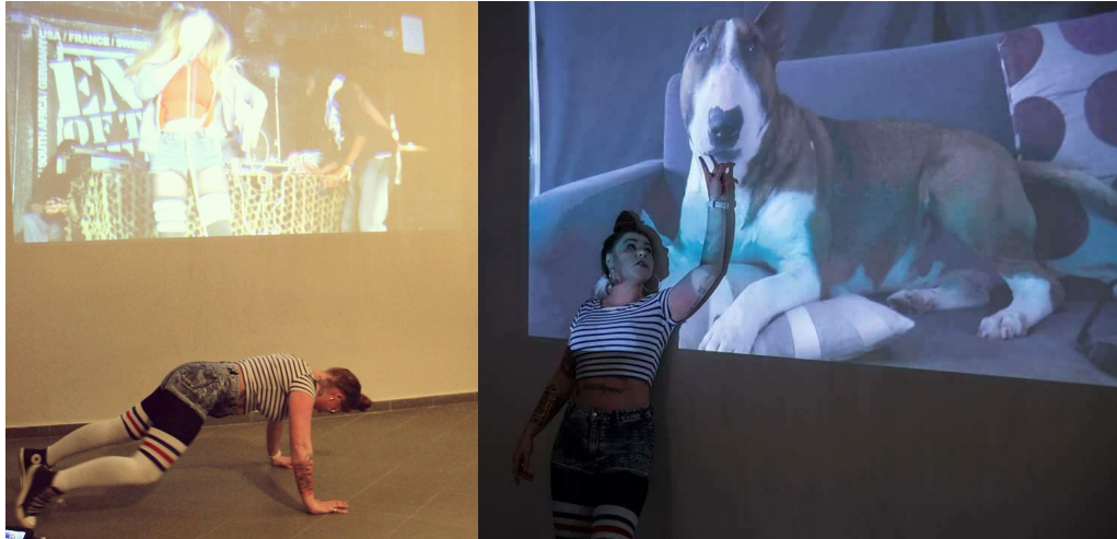
Day 3 of START Festival Start Theatre Festival, The Curators Lab, Poznań, Apr 2018. featured the second iteration of 'Miscellaneous'

Miscellaneous is a 'performance accompanied film presentation' developed with a view to ad libitum physical action and spontaneous verbal/vocal/sonic production. The fluid and unscripted process allows the work to unfold as unique to its particular space and audience. The films selected are chosen at random from the personal archives of the artist and loosely assembled to form a collection of excerpts with intermittent breaks amounting, in total to a 30/40 minute performance up to 8 hours. The purpose of the breaks is to allow space for the performative elements and responses to occur. However, performance/interaction is not confined to these windows.