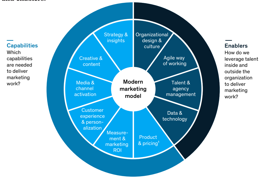
Exhibit 1 To deliver on growth, modern marketing requires updated capabilities and enablers.