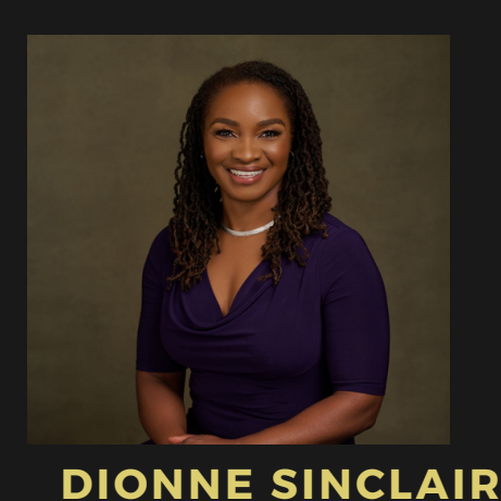
VP, Clinical Operations and Chief Nursing Executive, Centre for Addiction and Mental Health