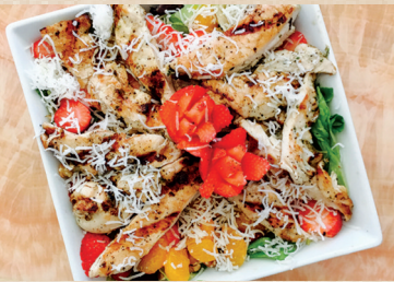
Mandarin Chicken Salad