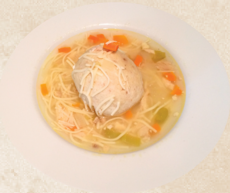
Matzah Ball Soup