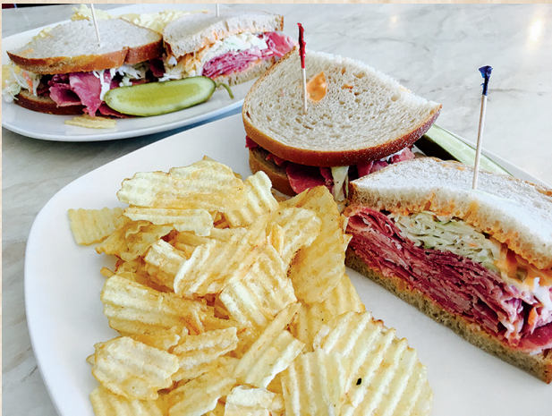
Corned Beef Special

All are served with cup of soup or salad, french fries, coleslaw and a pickle