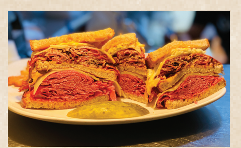
Corned Beef, Pastrami Special Club