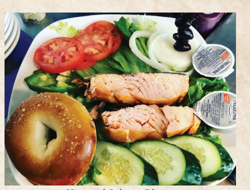
Kippered Salmon Platte