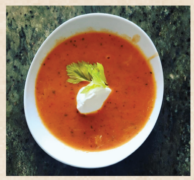
Roasted Pepper Soup