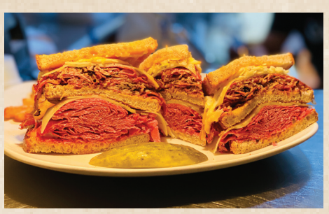
Corned Beef, Pastrami Special Club