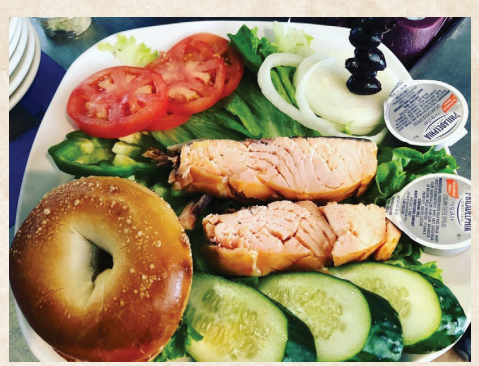
Kippered Salmon Platter