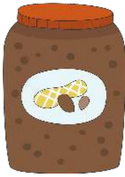
1 CUP PEANUT BUTTER