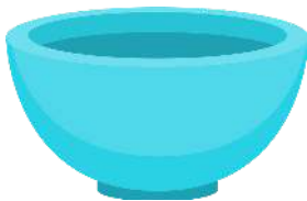
LARGE MIXING BOWL