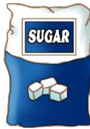
1/2 CUP SUGAR