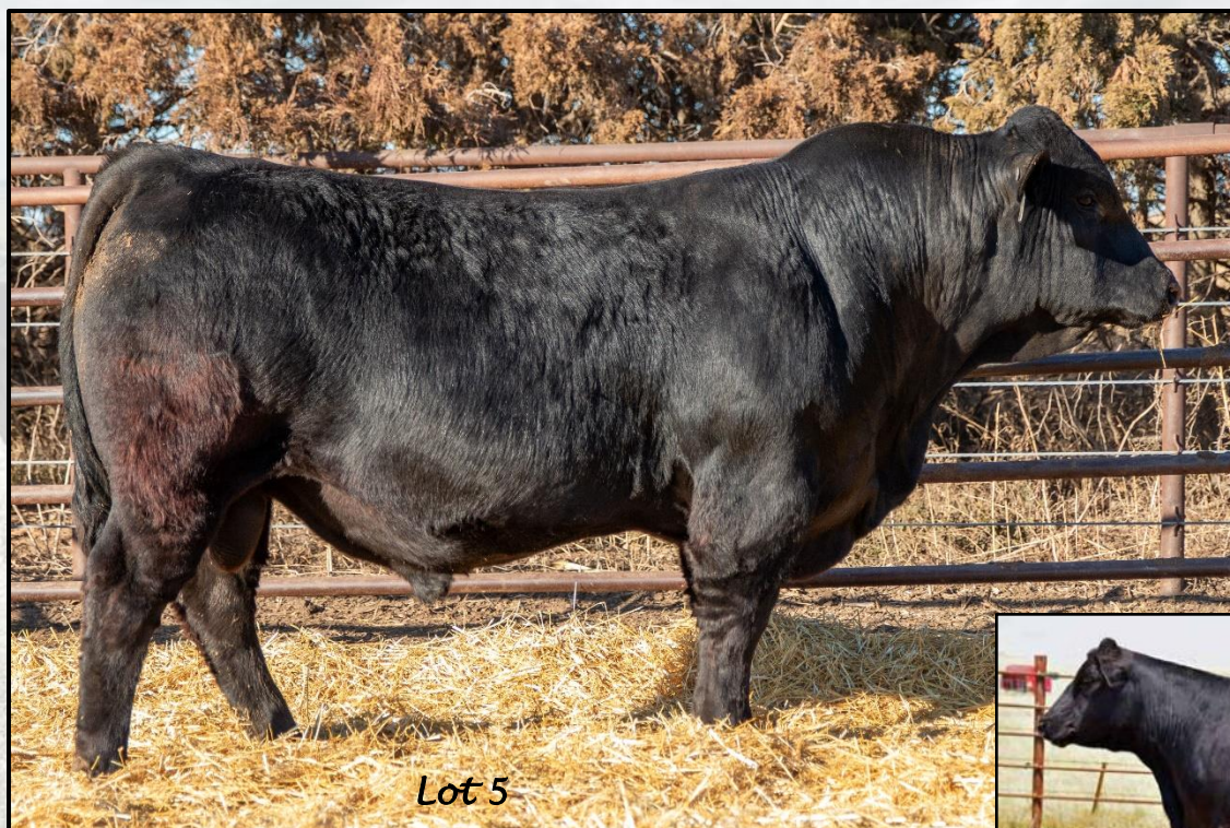
Dam to Lot 5 BEA 1457H ET