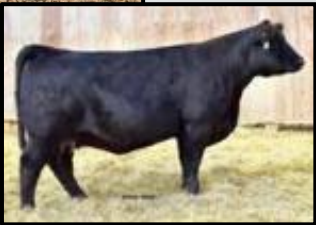
DLW Ms Edison 321A Grand Dam of Lots 5,6,10,

Lot 10 BARG Mr Growth Fund 098M ET is an exciting young sire! This stud is the full package boasting an incredible look from every angle. Wide from the ground up with a bold middle capacity and a smooth front 1/3. Elite set of EPDS featuring top 20% for BW, top 10% WW, top 3% YW, top 2% CW and top 5% for FPI! Now for his pedigree! His Grand Dam DLW Ms Edison 321A is no stranger to fame within the Gelbvieh breed. We pounced on the opportunity to buy 6110D from Beastoms dispersal and we couldn't be happier with the first set of ET calves. 098M's maternal brother is our 2025 Balancer Futurity Entry. After his retirement from showing he will be retained as resident herd sire here to introduce more of this bloodline into our herd. Crossed with Growth Fund this combination is one that certainly deserves a hard look!