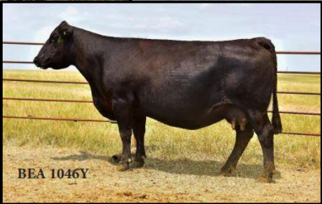
BEA 1046Y ET Donor Dam of Lots 32,37,38

BARG Mr Cash Out 913M ET Selling as Lot 38. 1046 crossed with Cash Out is another impeccable cross! 1046 has proven herself to be a no miss donor cow as we are offering 3 ET bulls out of 1046 and each one of them built with incredible quality. This bull is huge middled and super wide and stout from the ground up and built on a solid foot and bone structure.