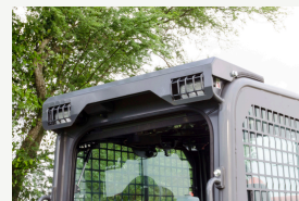
Sample Light Guard