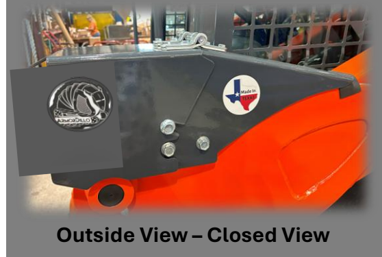
Outside View – Closed View