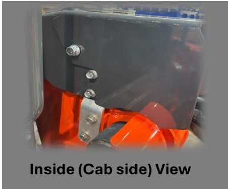
Inside (Cab side) View