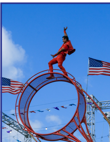
High Flying Pages