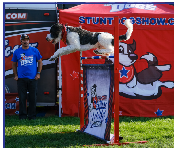
All-Star Stunt Dogs