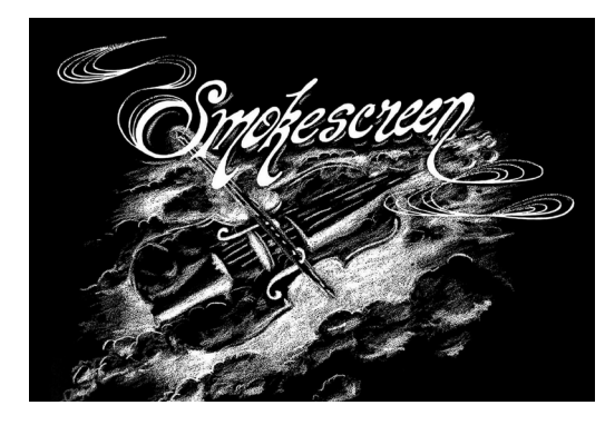
★ SMOKESCREEN ★ Thursday, August 15