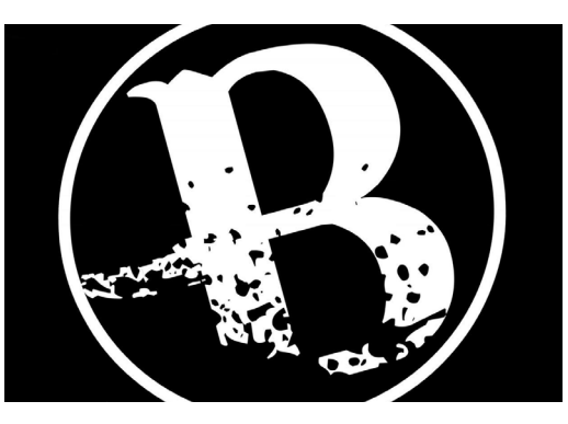
★ BRANDED ★ Wednesday, August 14