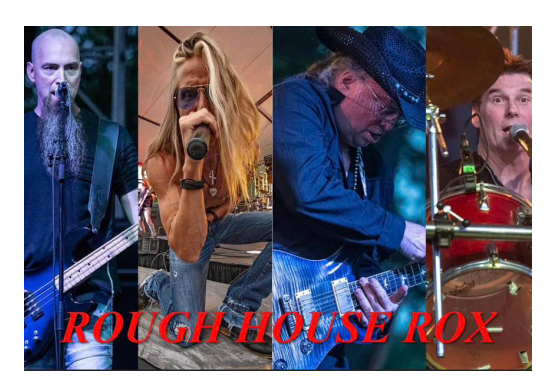
ROUGH HOUSE BAND Saturday, August 17