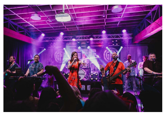
★ GOOD FOR GARY ★ Friday, August 16