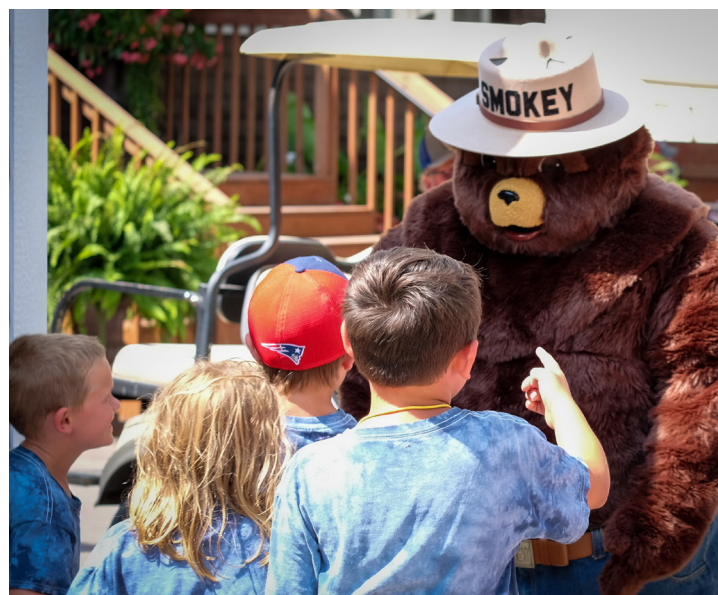
Steele County Free Fair Barker