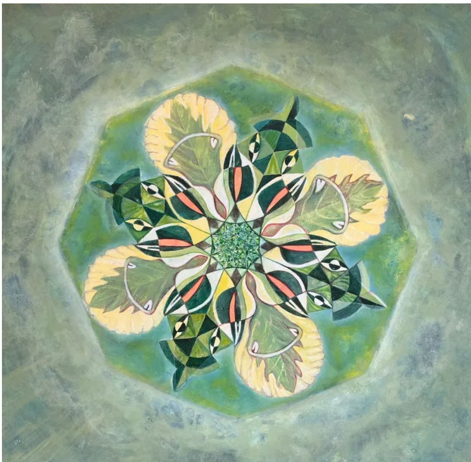
RainerGeist, H , 2025. Acrylic on paper, 31 x 31 inches.