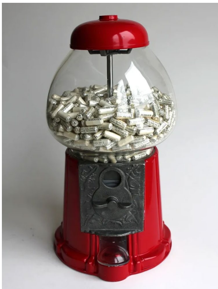
Paul Roorda, Penny Candy , 2012. Bible pages in capsules and vintage gumball machine, 15 x 7.5 x 7.5 inches.

With awareness of Paul's process, the paintings reveal even greater depth, becoming windows into the fragile state of our world. His paintings present a beauty that exposes an anxious turbulence that does not quite yet find a resolution. The quiet beauty and turbulence of the works can be construed as calls to immediate action and awareness of our collective responsibility.