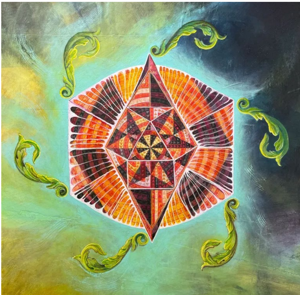
RainerGeist, Redemption , 2024. Watercolour, crayons, pastels and acrylic on paper mounted on plywood, 33 x 33 inches.