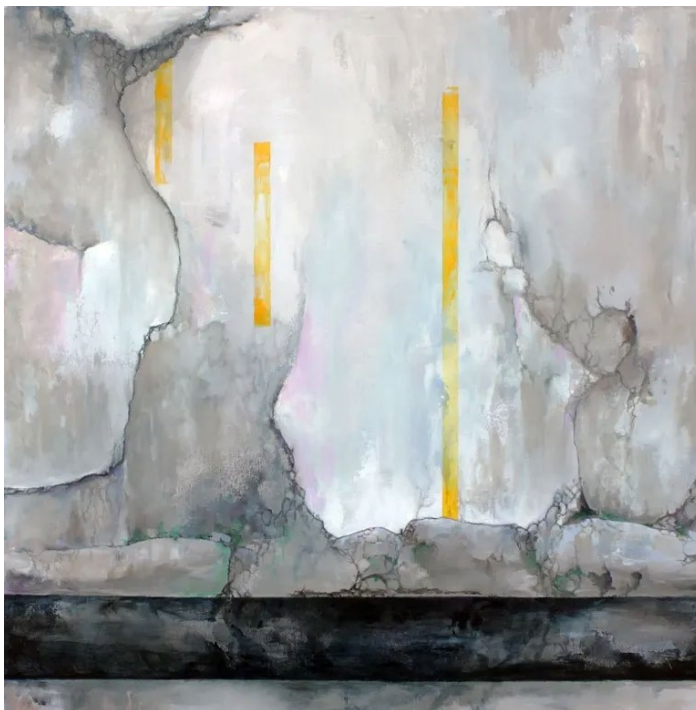
Paul Roorda, Delhi I , 2018. Acrylic on canvas, 30 x 30 inches.