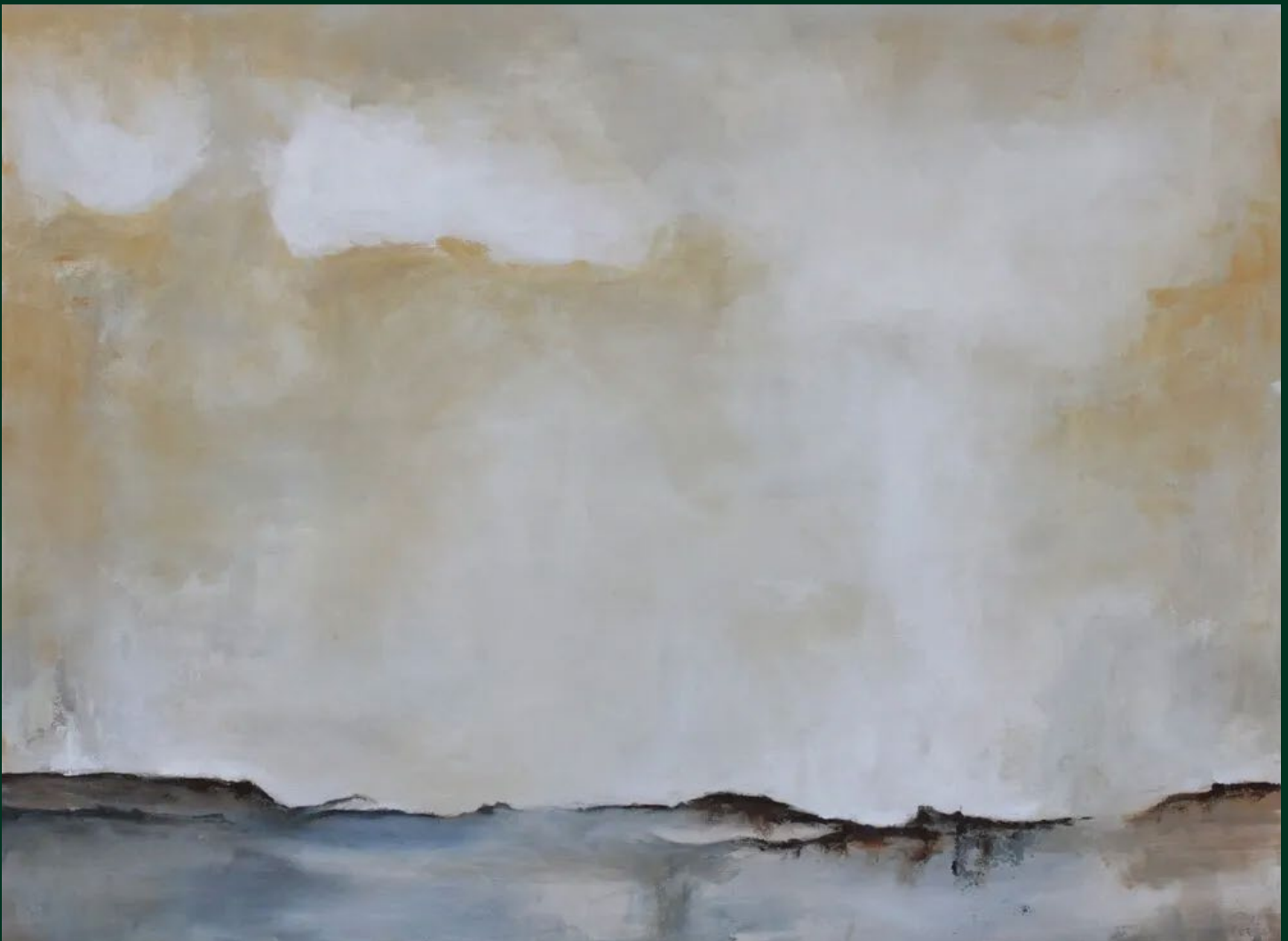
Paul Roorda, Thekkady , 2018. Acrylic on canvas, 24 x 30 inches.