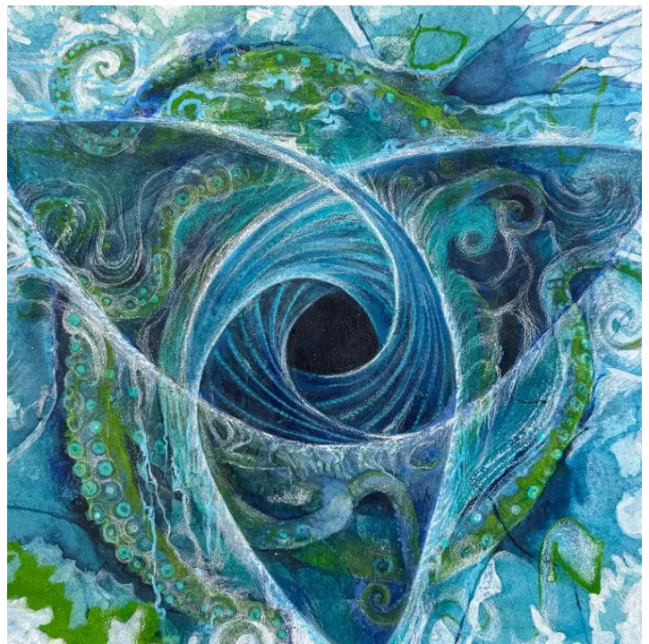
RainerGeist, Number 22 , 2020. Watercolour, wax crayons on paper, 17 x 17 inches.