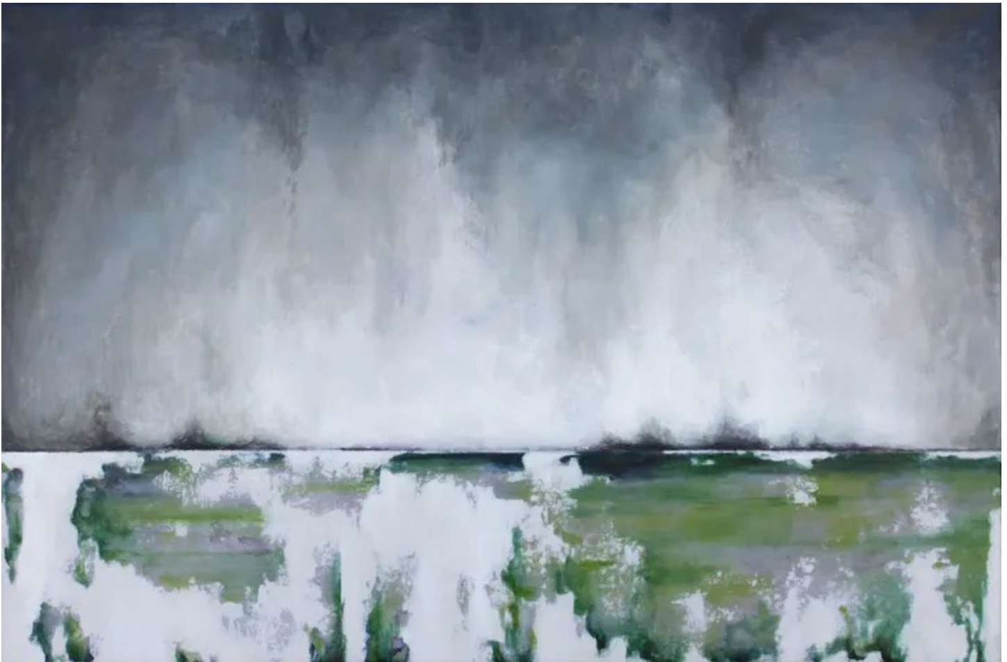
Paul Roorda, Tirana II , 2018. Acrylic on canvas, 24 x 36 inches.

A second layer of abstraction arises when Paul photographs these walls, removing them from their original context. Finally, a third layer comes through his meticulous, realistic painting of the photograph itself, which transforms the image into an abstract painting. At first encounter, the viewer may see landscapes defined by horizon lines, opening onto expansive skies.