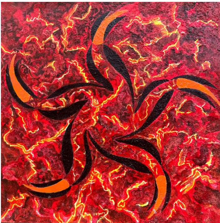
RainerGeist, Number 11 , 2020. Acrylic on paper, 17.5 x 17.5 inches.

For both artists, stillness is the realm where content and meaning are exchanged between artist and viewer. Creative power flows from their work into those who experience it, awakening the possibility of transformation and renewal. The exhibition invites viewers to pause, surrender, and allow art to become a part of their own creative and spiritual journeys.