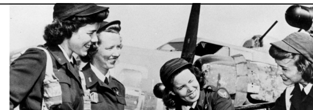
The original "Fly Girls". Between 1942 and 1944 over 1,000 women were trained to fly for the US military as WASP.