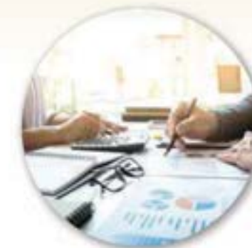
一流的金融和保險創新服務 Elite Financial & Insurance Innovative Services