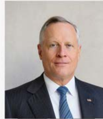
Ross Perot Jr.

Chairman, Hillwood and The Perot Group Chairman of the Board, U.S. Chamber of Commerce