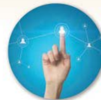
多位一體 高階訂製 Synergy, Personalized Services

美國奧淇國際金融/美國宏盛保險與理財，我們集結了三十年的經驗，配合全球頂尖財務規劃師、律師、會計師，團隊超過 4000 人，在全美 20 個分公司為您提供最完善的國際理財平台及最專業的培訓指導，幫助您成功服務中美兩地高端客戶。