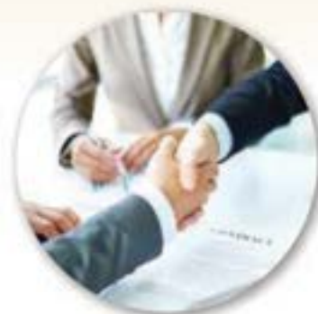
財富積累 世代相傳 Build and Transfer Wealth