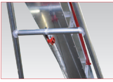
Block and pulley lift system makes raising and lowering an easy task on chassis units. Galvanized chassis lasts for years of service.