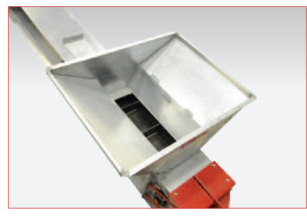
Generous 34^{''} x \, 24^{''} bulk bag hopper is standard on chassis models, low profile hopper also available.