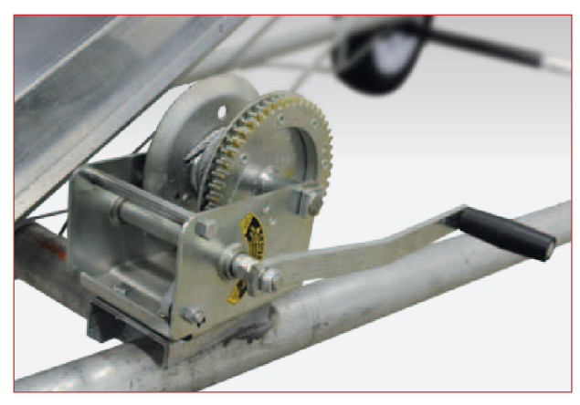
Heavy duty winch with automatic brake for raising and lowering conveyor.