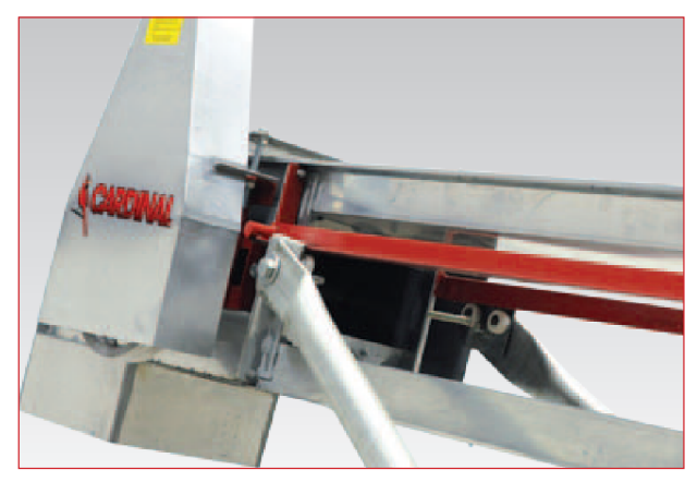
Polymer rollers on chassis units for easy height adjustment. Powdercoat and galvanized finish provides tough corrosion protection.