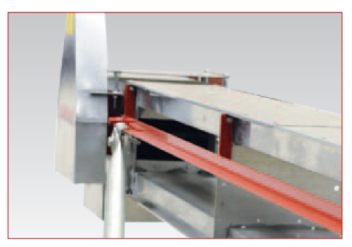
Heavy duty adjustable motor mount allows for most standard drive motors.