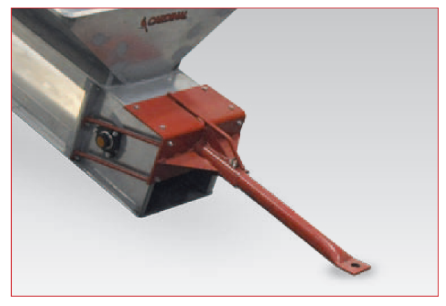
Rugged hitch makes transporting simple and safe.