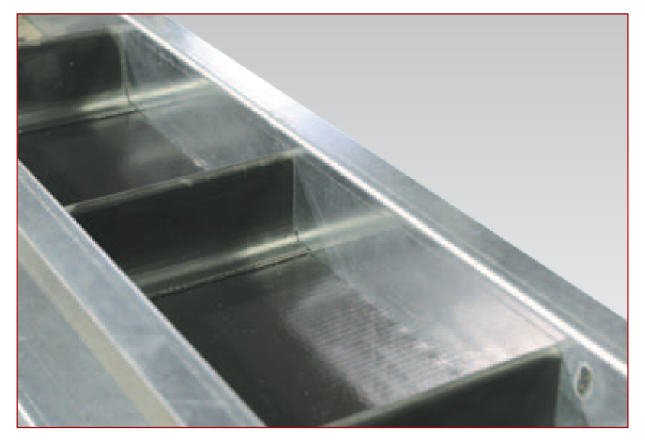
Belt custom-fitted at the factory for less seed damage and loss.