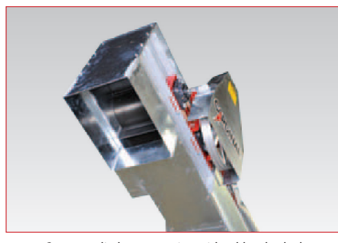
Generous discharge opening with rubber-backed end plate minimizes clogs and seed damage