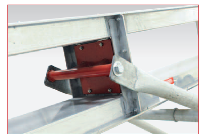
Automotive grade fasteners and precision laser cut parts ensure easy assembly and repair.