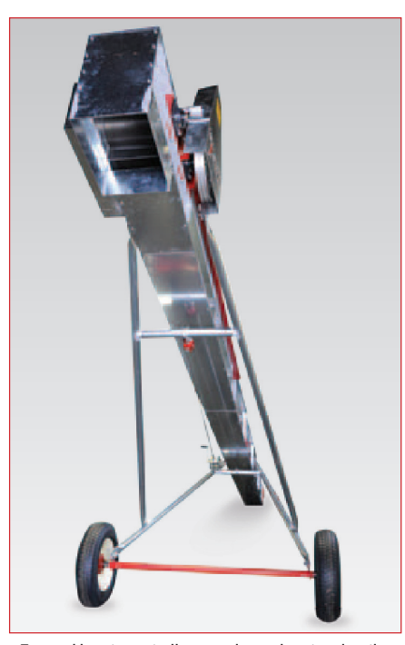
Tapered bearing spindles on axles and optional trailer rated tires allow for worry free transport.