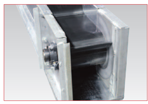
Durable cleats for fast and gentle material flow.