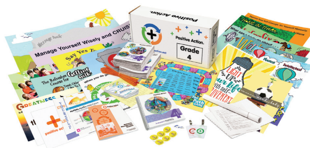
Grade 4 Instructor's Kit

Grade-specific classroom curriculum kits with scripted, but adaptable, lessons that take 15–20 minutes.