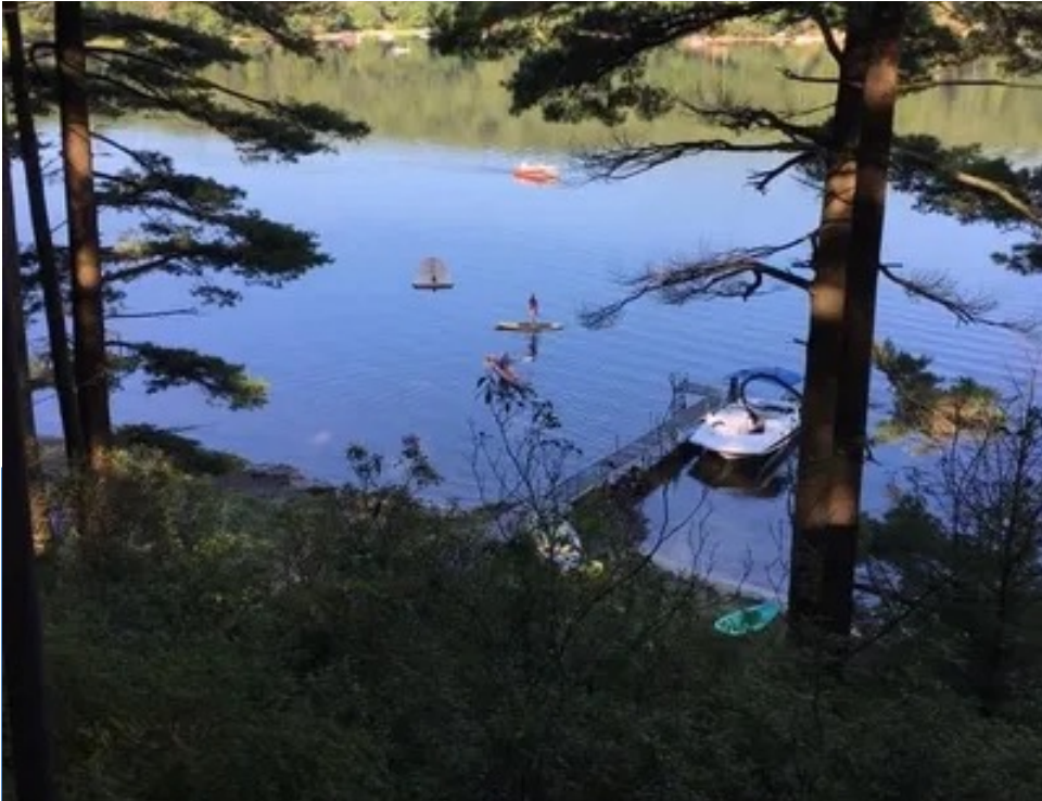
Quacumquasit (South) Pond, Brookfield, MA