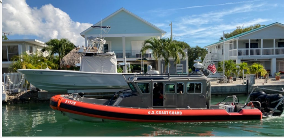
Coast Guard checking out the canals