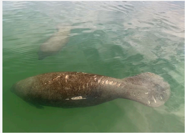
Mama and baby spotted Dec 5