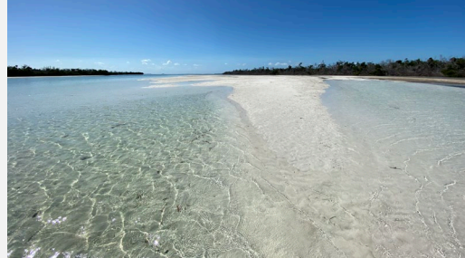
Enjoying the water