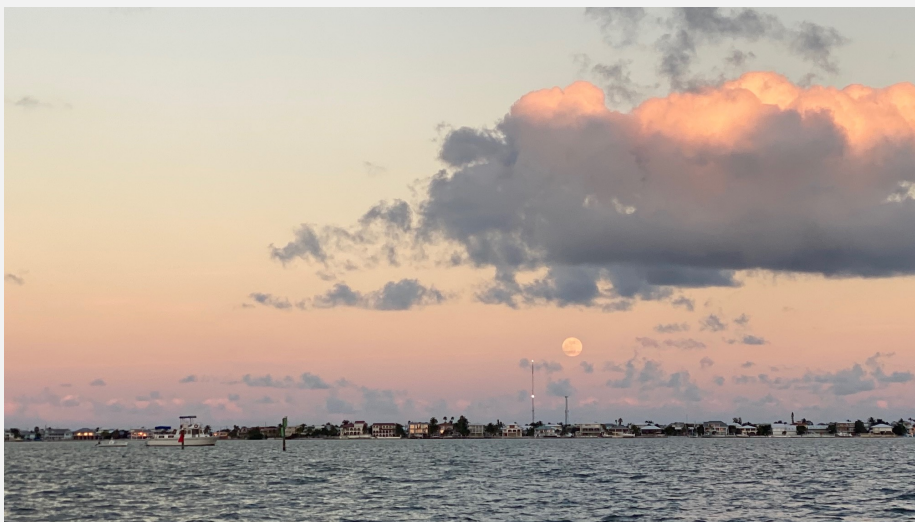
Moonrise over Summerland Cove

Something fun, interesting or exciting happening in your part of Summerland Cove and you're willing to share? Please send a picture and caption to summerlandeditor@gmail.com