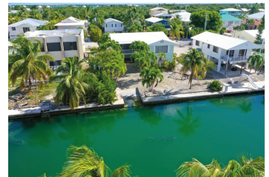
940 E Caribbean Drive