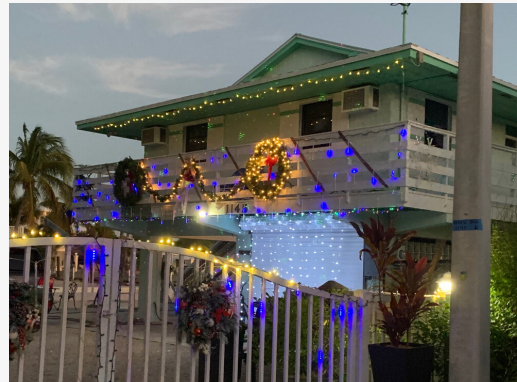
Holiday Decoration Contest