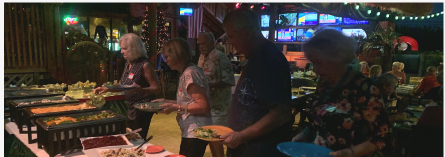
Holiday Social at Boondocks