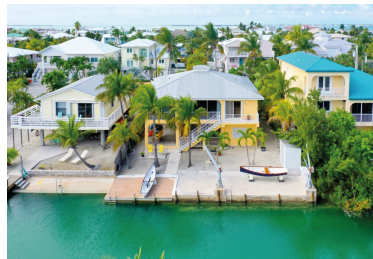
947 Gulf Drive