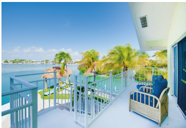
829 Lagoon Drive

940 E Caribbean - this listing just sold for 99% of list price