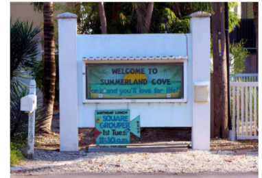
SCCA Event Marquee