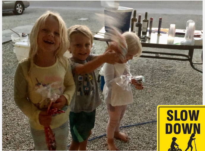
Lighted Cart and Bike Parade