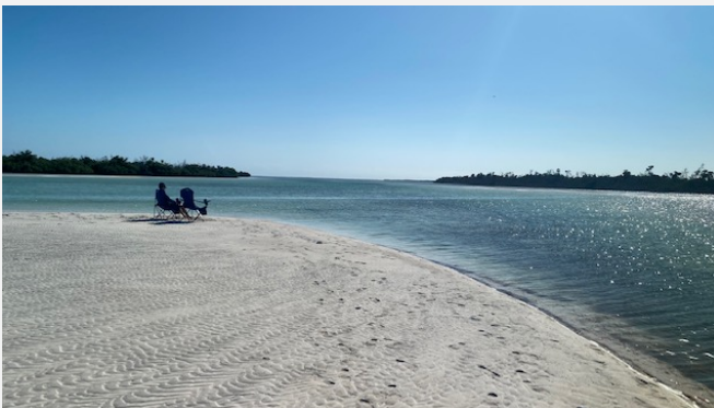
"The sea cures all ailments of man," - Plato

Something fun, interesting or exciting happening in your part of Summerland Cove and you're willing to share? Please send a picture and caption to summerlandeditor@gmail.com