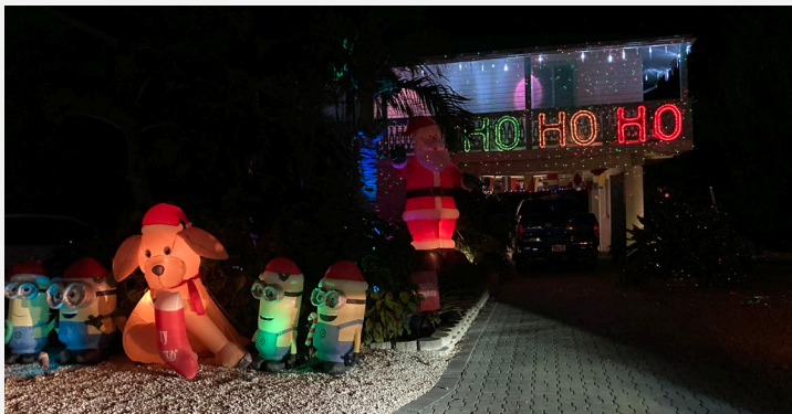
More holiday cheer around the neighborhood